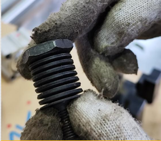
Old and worn out diechase spring