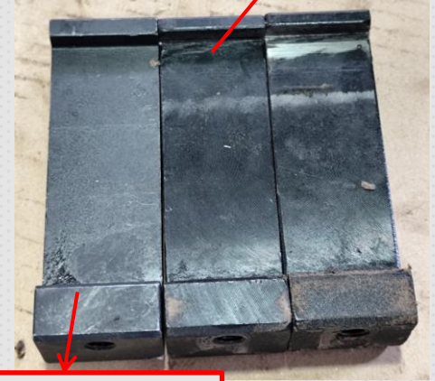
Old metal bar on the cylinder with scratches

*The spring should have a plate-like curve to support its spring-motion, the old spring lost this shape due to being worn-out.